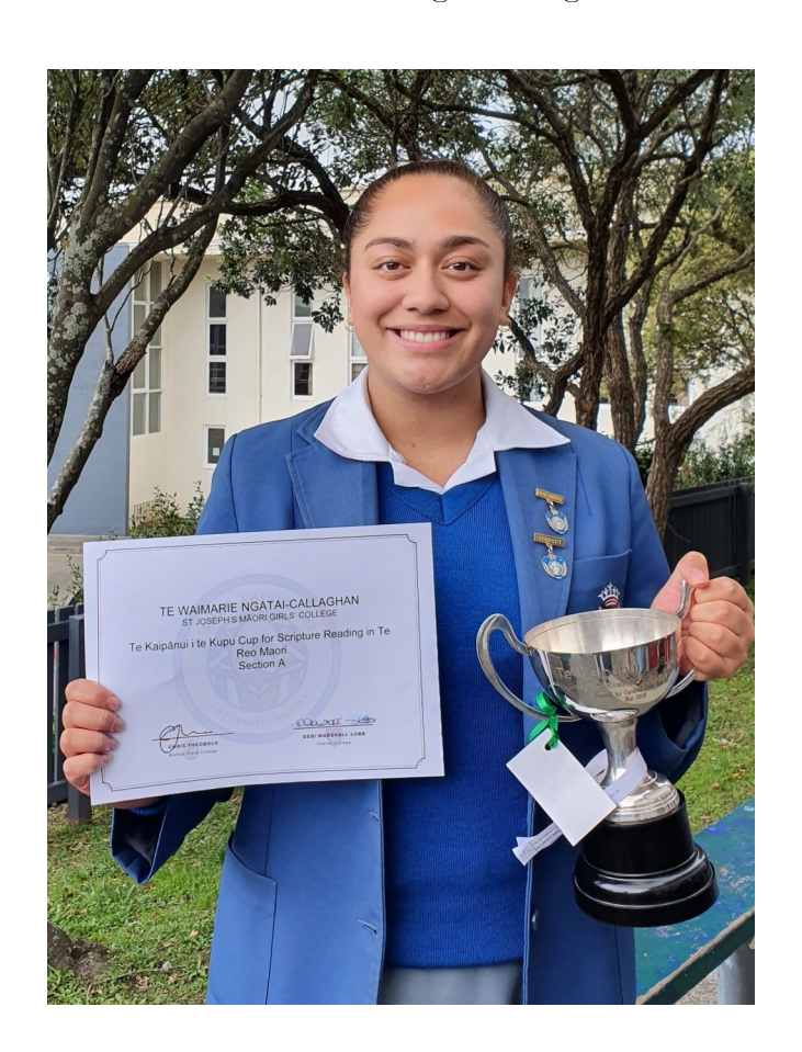
Outside Viard College